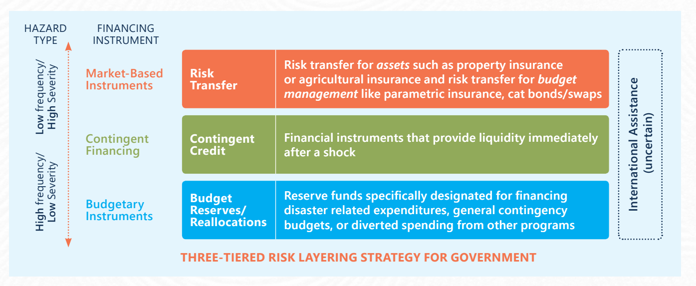
FIGURE 2: RISK LAYERING STRATEGY FOR GOVERNMENTS

As indicated in the graphic below, a comprehensive disaster risk finance strategy utilizes different financing instruments for different types of risks. Risk transfer is best suited to high-severity / low-frequency events occurring less than every 10–50 years, such as severe floods, droughts, cyclones, or earthquakes. In the case of more frequent risks, paying an insurance premium to cover these costs is inefficient, and other disaster risk financing instruments such as contingent credit or budget reserves/reallocations should be used.