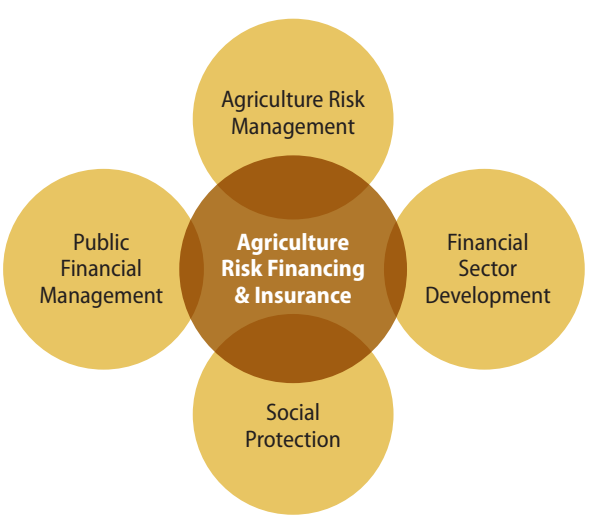
Figure 5. Agricultural Risk Financing and Insurance at the Intersection of Different Policy Areas

Source: GFDRR 2012; World Bank-GFDRR Disaster Risk Financing and Insurance program 2014.