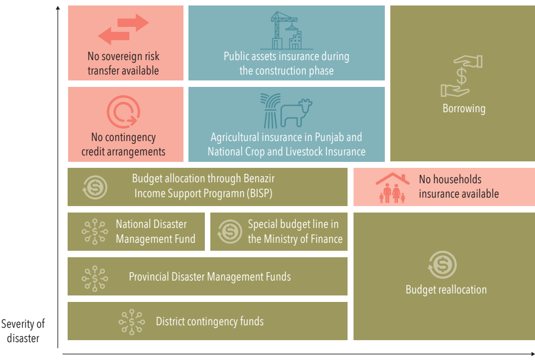
Figure 2. Current approach to risk layering in Pakistan. Note: blue - risk transfer instruments; green - risk retention instruments; gray - unavailable.

Pakistan has some risk financing instruments in place, but they have been implemented in isolation and more work needs to be done to coordinate efforts to ensure that there is no duplication of coverage. For example, there are National and Provincial Disaster Management Funds and contingency funds available at national and district levels but the relationship across the management of these is unclear and could benefit from a coordinated approach to outline the roles and responsibilities of the respective funds. For disbursing the funds to the vulnerable people, the GoP has established BISP. Several agricultural insurance pilots exist, as well as some level of insurance of public assets (during their construction). However, with limited availability of funds and the above challenges, the GoP will likely have to resort to post-disaster budget reallocation and/or borrowing after major natural disasters.