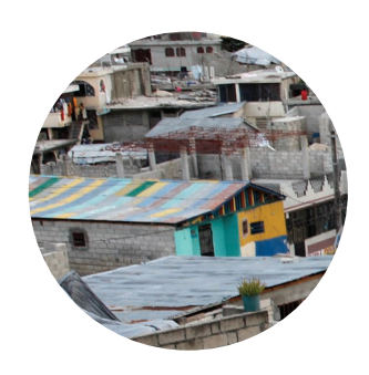
$50 billion to $200 billion increase in average annual weather-related losses & damages alone since the 1980s.

Supporting countries to manage the cost of disaster and climate shocks